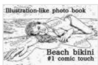
Illustration-like photo book Beach bikini #1 comic touch