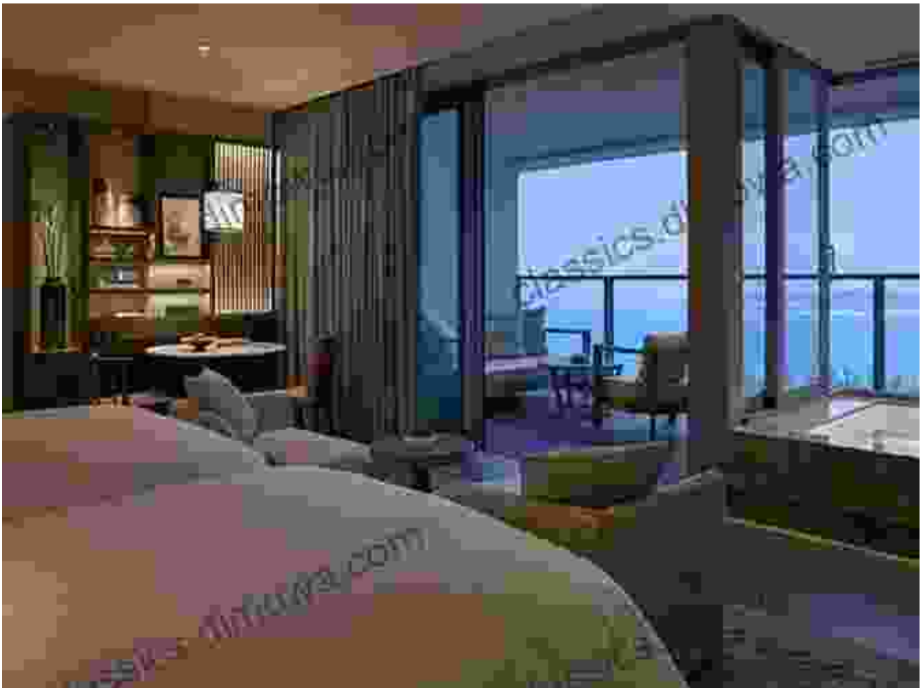
Hotel Name 1